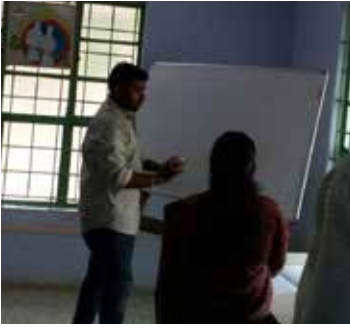
^ Vocational Training : Computer training in Tally and photoshop provided by trainers appointed by Texcity on 28.10.17