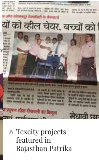
^ Texcity projects featured in Rajasthan Patrika