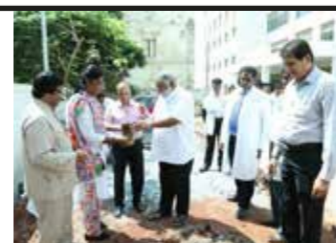
18 saplings planted on GOV