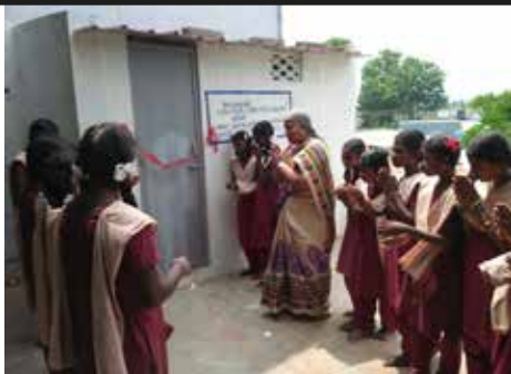
< Texcity Annets Club has contributed Rs.15,000/- for the construction of a toilet at Mutathuvayal tribal school for the girl children over there. About 100 young girls would be benefited by this.