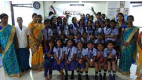
< In continuation of the Eye examinations done at Brindavan School, 32 children were brought to Vakil Eye Clinic for complete and thorough examinations. 16 children were provided spectacles free of cost. The clinic has decided to bear the cost of Rs. 28,800.