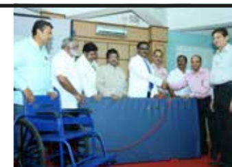
100 Mattresses provided 15 Wheelchairs provided for patients