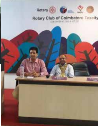
v Club assembly on 25.10.17