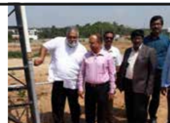
Drip irrigation provided for 1000 saplings planted at the beginning of the year at SNMV College