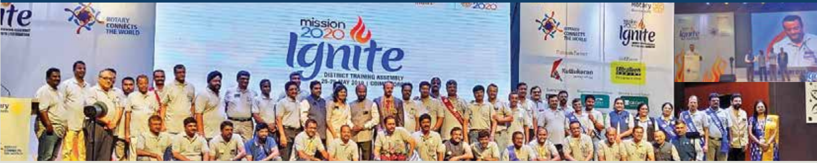
The District Training Assembly IGNITE 2020 was conducted on 25/05/19 and 26/05/19 at Hindustan College. A glimpse into IGNITE 2020.....