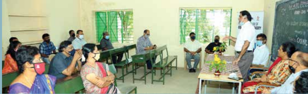
Classroom Block at Narasipuram School.