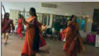
DIWALI Family Gettogether