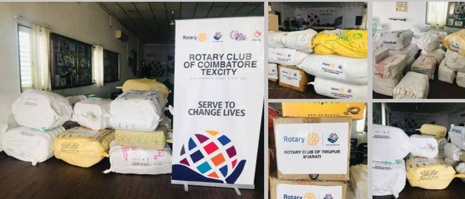
A Quick Response from Rotary Club of Coimbatore Texcity join by Rotary Tirupur Bharati and Rotary Tirupur Next Generation for contributing to the flood hit area at Kanchirapally, Kerala. Flood Relief materials like Rice, Bedsheet, Towels, Kitchen Utensils, Napkins, Water Bottles etc., worth Rs. 3,50,000/- was sent to Rotary Club of Kanchirapally. The same was distributed to the flood affected peoples by members of Rotary Club of Kanchirapally.