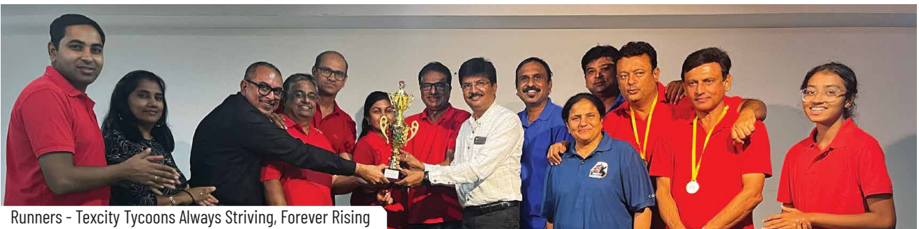
Runners - Texcity Tycoons Always Striving, Forever Rising

Winners - Texcity Super Kings, Champions by Nature, Kings by Victory!!